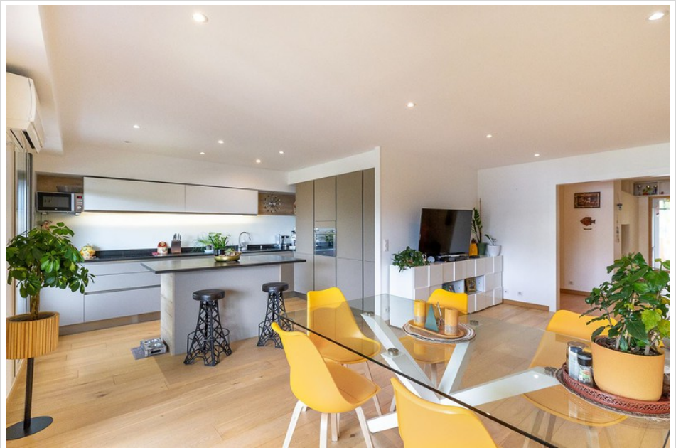
Apartment 1337 Nice

Fees paid by the owner, well condominium(3960 lots in the condominium), no current procedure, information on the risks to which this property is exposed is available on georisques.gouv.fr